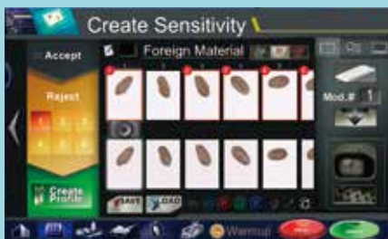
Automatic Sensitivity Creation